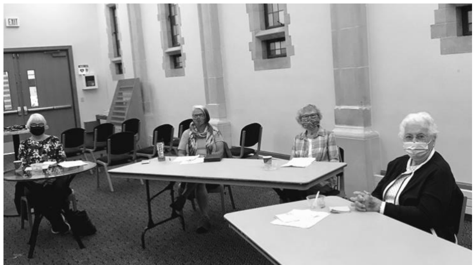
Martha Circle members meet in the Gathering Place to learn about Priscilla.